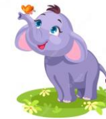
Zo San (Japan - Children's Nursery Rhyme)

We will be listening to music from China, Japan, India, and Pakistan.