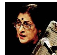
Sahela Re by Kishori Amonkar (India - Hindustani Classical Music)