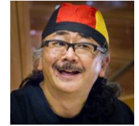
Prelude and Liberi Fatali from Final Fantasy by Nobuo Uematsu (Japan - Modern Japanese Classical Music from Video Gaming)