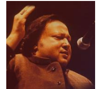
Musst Musst by Nusrat Fateh Ali Khan (Pakistan - Qawwali)