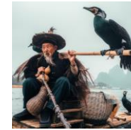
Fisherman's Song at Dusk (China - Traditional Chinese Classical Music)